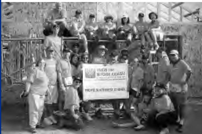
Building the Reform movement often means literally building homes to help those in need, as exemplified by these volunteers of the URI's Pacific Southwest Council in California.

The World Union, through its NGO (non-governmental organization) representatives, also has a distinct presence and voice at the United Nations. It has been