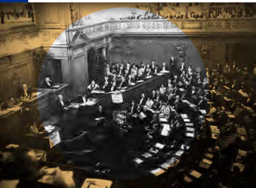
Delegates gathered in Berlin in 1928 for the first international conference of the new World Union for Progressive Judaism.

The Reform movement in North America, having been built upon German roots, has been from its inception a stalwart constituent of the World Union. The North American Reform movement is today the largest and