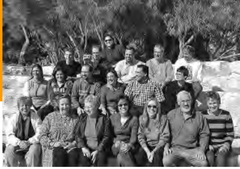
The Beutel Leadership Seminar class of 2005

The World Union has recently expanded its work in training paraprofessional and lay leaders. Its Institute for Modern Jewish Studies in Moscow (Machon) now operates full time to locate, train and place community workers throughout the former Soviet Union. Recent program upgrades have greatly enhanced the quality of the Machon and its attraction for individuals committed to serving as leaders in their respective Progressive communities. The first year of the program has been integrated with the prestigious Russian State University for the Humanities in Moscow, allowing students to receive academic credit for their Machon courses.